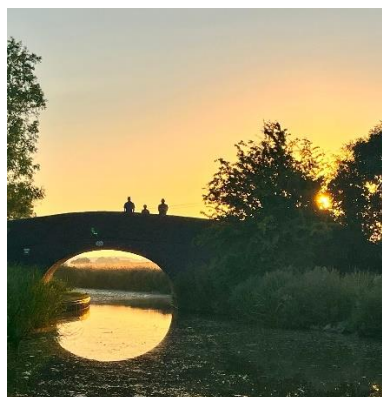
Sunrise over the Ashby Canal. Plus support team