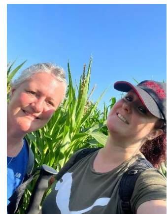
Hot in the maize!