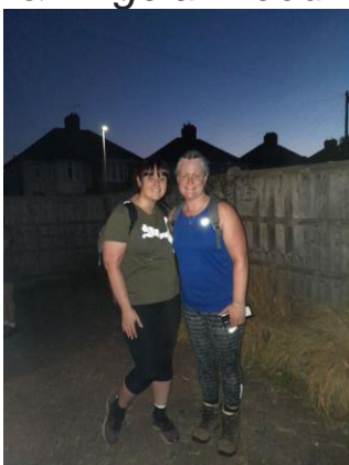
4.55am, and they're off!