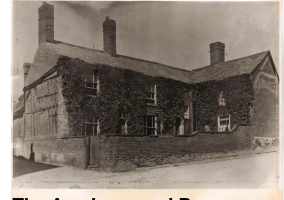
The Academy and Parsonage